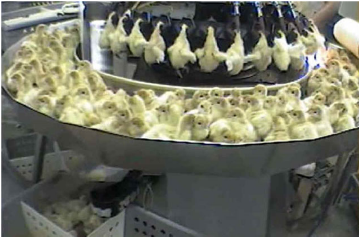
Newborn turkeys on a laser debeaking carousel in a mechanized hatchery.