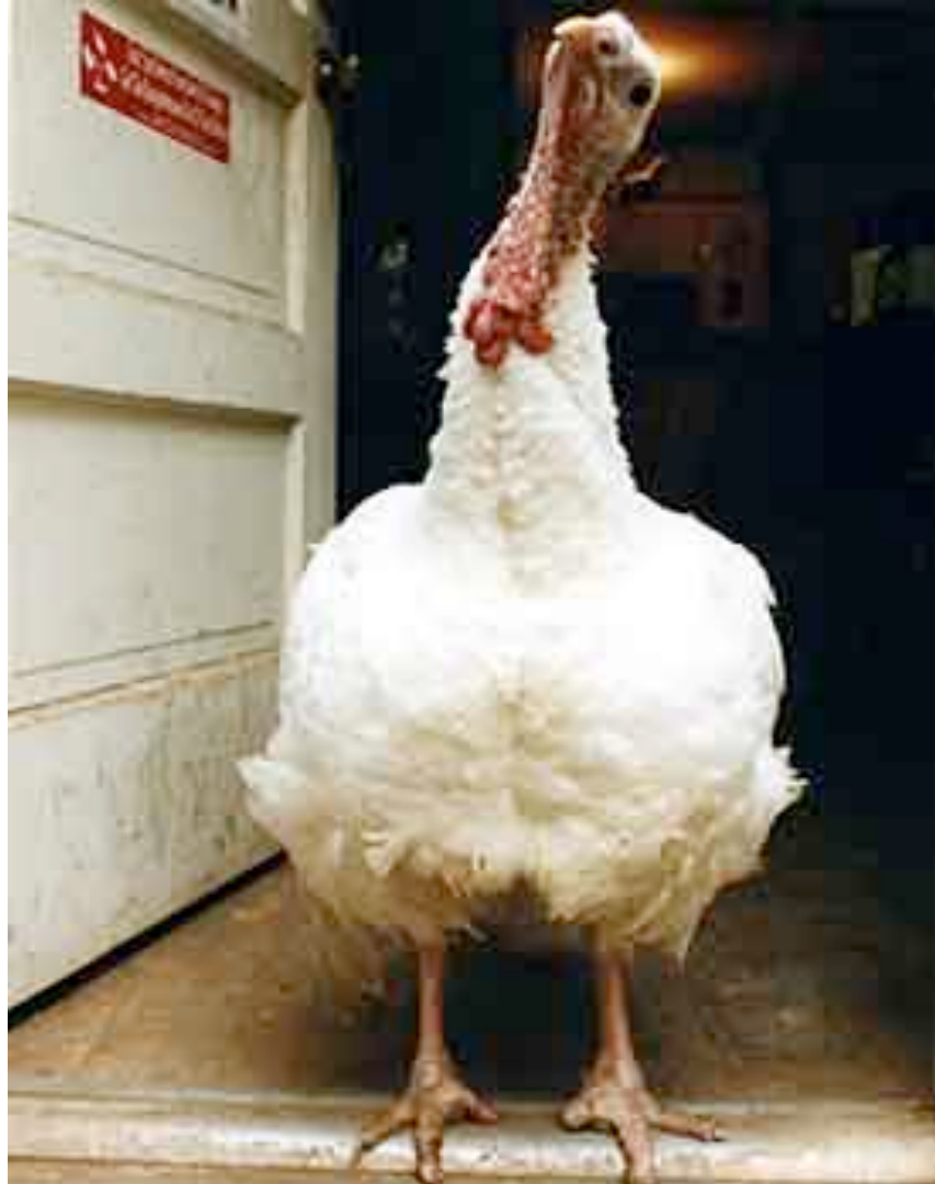
Photo of Abigail at UPC's sanctuary courtesy of The Washington Times .

Abigail invites us to get to know them . . .