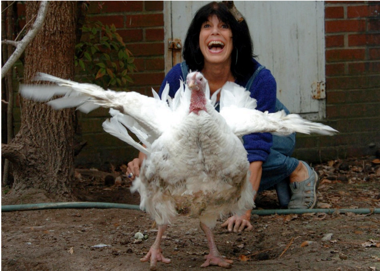
November 25, 2004, Thanksgiving Day.