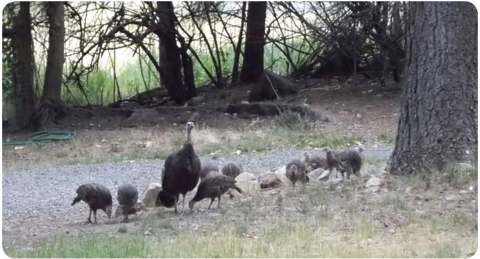
Mother turkey with her growing family in Jacksonville, Oregon.