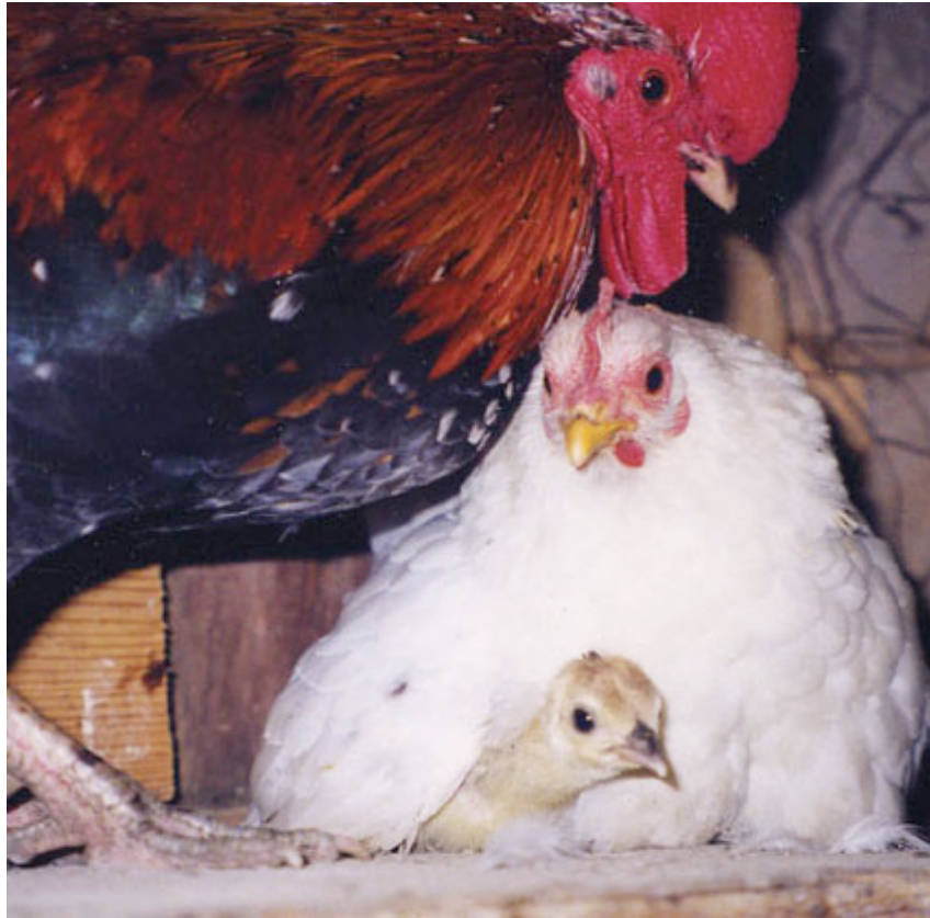
Rooster Lincoln, hen Sno-Pea and chick Luv-Bug

MOTIVATION: Ask the children to name the birds they know. Ask them how they know it's a bird.