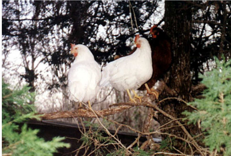
Hens roosting in trees at United Poultry Concerns Sanctuary

United Poultry Concerns, P.O. Box Box 150, Machipongo, VA 23405 Phone #: 1-757-678-7875