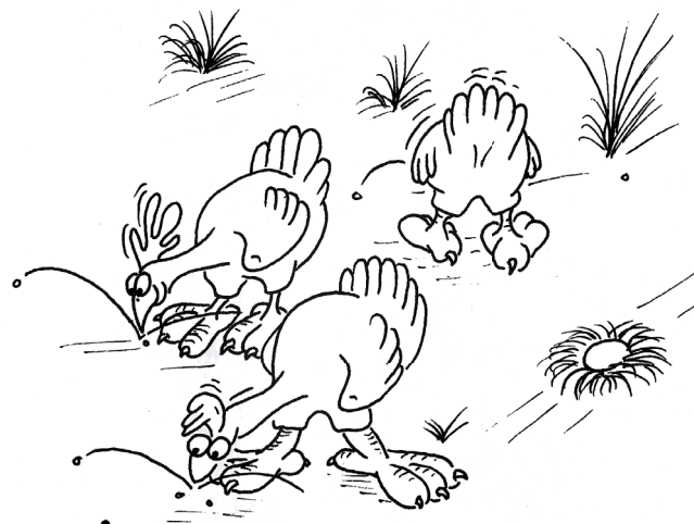
Spending the whole day roaming around and scratching the ground are things chickens love doing best.

One of my hens seemed to be a throwback, however, and began spending all her time in the hen house, sitting on the nest. Since I had no rooster, the eggs weren't fertile and her efforts would have proven futile had I not procured some fertile eggs from my neighbors and placed them in the nesting box. Nineteen days later, I woke to see her out in the yard followed by five little red balls of fluff. She was an attentive mother, teaching the chicks to scratch and all the best places to look for food. Soon the chicks were as large as their "mother," but they still gathered underneath her at night. It was so comical to see these large, gawky adolescent youngsters sticking out on all sides of the little white hen.