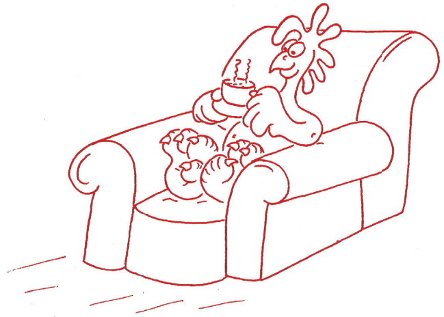
In the hope that chickens will be better understood and respected by future generations.

Sick of salmonella? Our exciting booklet invites you to cook and eat happily without eggs! 16 delicious recipes. $1.50. Order Replacing Eggs from United Poultry Concerns.