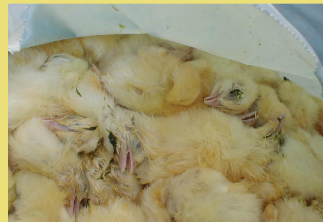
Male Chicks Suffocated in Trash Bags

Along with defective and slow-hatching female chicks, they are trashed as soon as they hatch. Upon breaking out of their shells, instead of being sheltered by a mother's wings, the newborns are